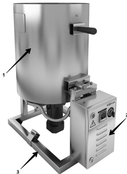
Fig. 1 Main components

Caramelizer has following components: 1 – Kettle with mixer and heaters; 2 – Control unit; 3 – Mount base, see Fig.1: